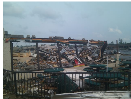
Milo's Hamburgers in Tuscaloosa. I ate there less than two weeks before this photo was taken.

Pleasant Grove, Tuscaloosa, Pratt City, Concord, Cullman...the list grows. At this time, the death toll in Alabama is 264 and growing. I was in Tuscaloosa less than two weeks before, and a place where we ate is now gone, as are