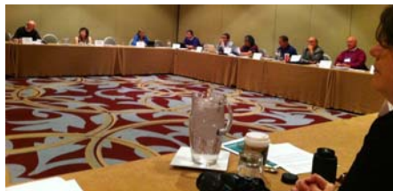
a legislative committee in session